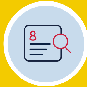
Assess and identify